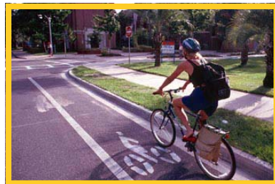
State standard roadway design with 5 foot designated bike lane

The ratings are to be used as a guide as to how much interaction with traffic a bicyclist can expect. For more information or to obtain a draft copy of the Bicycle Suitability Map please visit our website at: www.LakeSumterMPO.com .