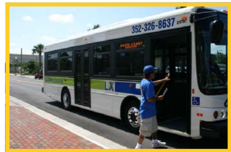
A passenger of LakeXpress boards a bus in front of the Lake County Administration Building in downtown Tavares

LakeXpress continues to attract more than 250 passengers daily. Proposed route refinements for the Leesburg Circulator will be addressed at a public hearing scheduled Nov. 19 at the Leesburg Community Center from 2-7 p.m. A downtown Mount Dora circulator is scheduled to begin in 2008. For more information about LakeXpress including