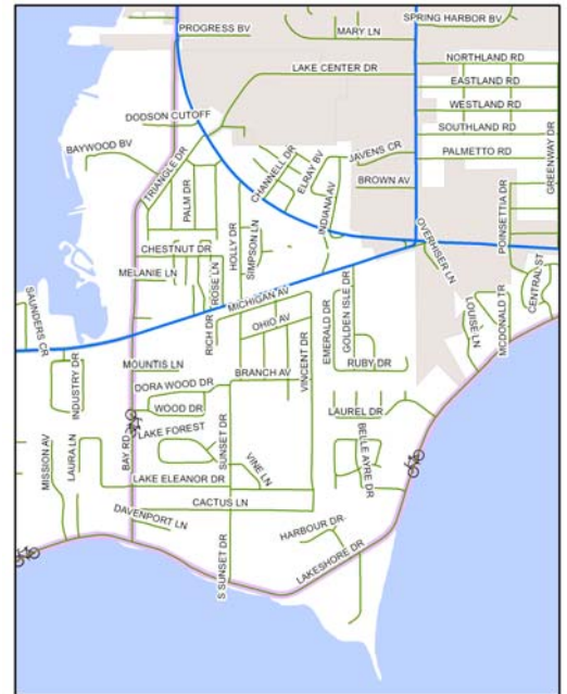
Map detail of LakeShore Drive area between Tavares and Mount Dora

Projects of the Lake~Sumter MPO are for the people of Lake and Sumter counties. Public Involvement is a primary factor in our planning process. The Lake~Sumter MPO wants to ensure that the public has a major say in the development of our regional transportation network. Ideas and suggestions gained from our citizens are reflected in the planning decisions of the MPO Governing Board. Please take the time to voice your ideas. Your voice will be heard. You may voice your ideas and comments by logging on to: www.LakeSumterMPO.com . Click on the Voice your Ideas button. You may also share your thoughts with the MPO by mail: at 1616 South 14th Street, Leesburg, FL 34748, or call (352) 315-1070.