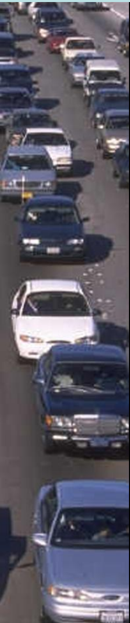
Florida Population: Annual Net Increase